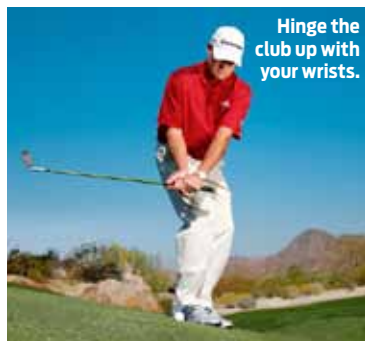
Hinge the club up with your wrists.

The key to pulling of this shot is to change to your setup. Instead of an orthodox position you should place your feet relatively close together and aim your toes down the slope at a 45-degree angle to your target line. Position the ball off your right heel (yep, your heel) and set your hands well in front of the clubhead. Once you have this setup all you have to do is cock your wrists and bring the club up so it parallel to the ground and then wing down with the handle of the club leading the clubhead all the way. Don't allow the clubhead to pass your hands as this will cause the club to bottom out before the ball.