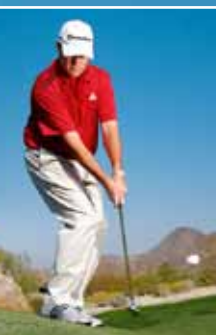
Keep the clubhead behind your hands.